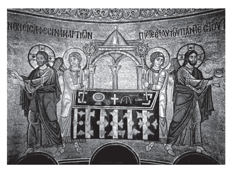
Fig. 5. Eucharist. Fragment of a mosaic in St. Sophia's Cathedral.

of transmitting information through the mural here becomes fundamentally different from the ones used in canonical frescos or mosaics, or even in the gallery of images of noble families' members. As in ancient Chinese pictorial images, commoners are depicted in natural poses, with emotions on their faces. In the fresco "Hippodrome", the artist tries to embody the prospect of space and draws tiers with the boxes for spectators, window shutters and even the rustication of walls in detail (Fig. 7).