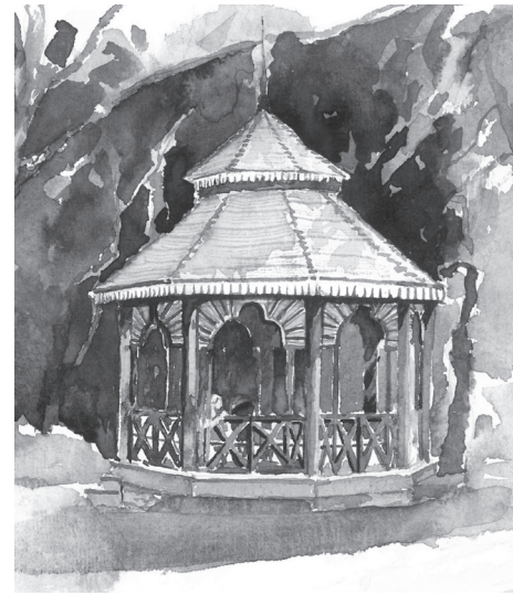
Fig. 2. The Chinese gazebo in Oleksandriia. Watercolour by Chang Peng, 2020.