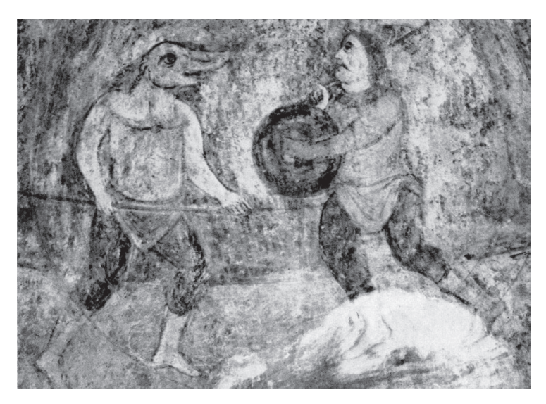
Fig. 6. The fight of the mummers. Fresco on the walls of the stairs of the Northern Tower of St. Sophia's Cathedral in Kyiv.

is devoted to the Catholic icon of Poland of the 16<sup>th</sup>-18<sup>th</sup> centuries, which allows us to understand trends typical for the development of Ukrainian sacred painting in comparison with the development of Polish sacred painting.