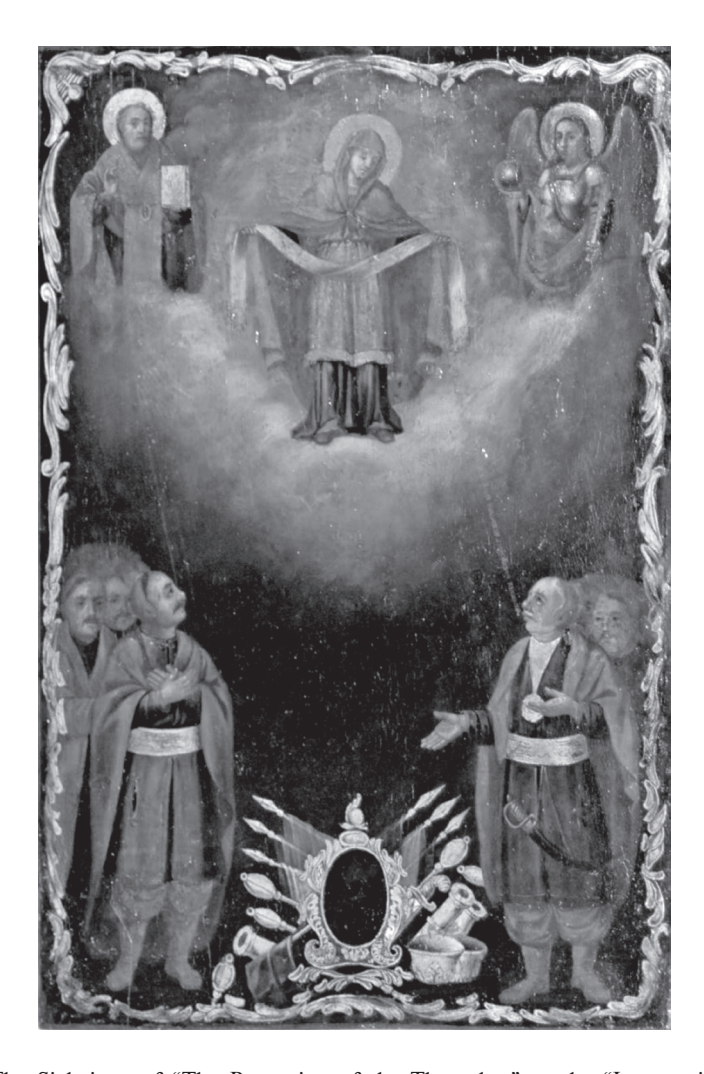
Fig. 8. The Sich icon of "The Protection of the Theotokos" or the "Intercession of the Theotokos" that depicts the last koshovyi otaman (Cossack leader) Petro Kalnyshevsky, a Zaporizhzhia Sich foreman, judge, clerk and others. A copy of 1836 of the original Sich icon, as evidenced by the inscription on the back: "A copy of the old icon located in the Zaporizhzhia Sich and now intact located in the village of Pokrovske which used to be the Sich. A copy of 1836 was written for the Odessa Society of History and Antiquities".

are also borrowed from the Catholic tradition, where real people with their wives and children are depicted under the protection of the Mother of God, Jesus Christ or patron saints.