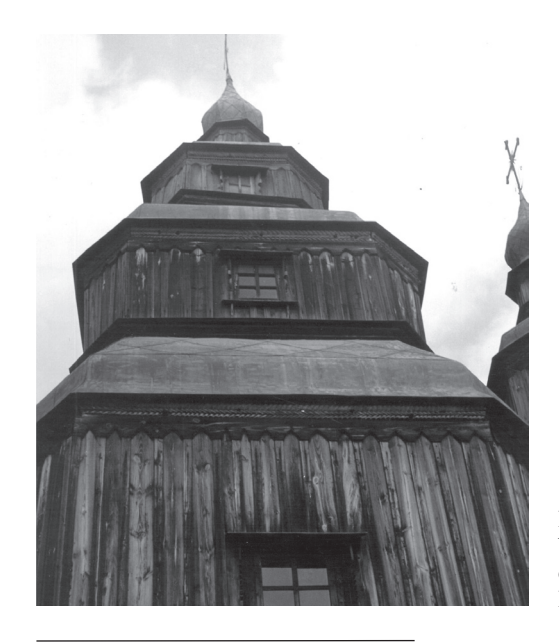
Fig. 4. The use of ornamental water symbols on the eaves of Saint Paraskeva's church in the village of Zarubyntsi (1742).

When the traces of gross fetishism in Ukrainian beliefs were almost entirely erased, there are still enough traces of animism and anthropomorphism ...".<sup>21</sup>