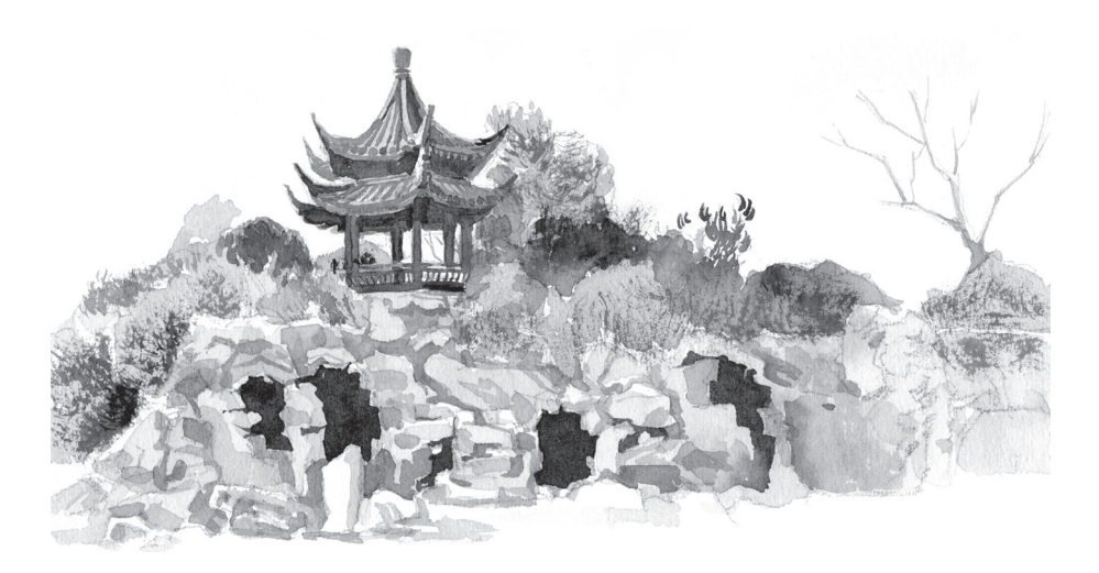
Fig. 1. The gazebo in the garden of Suzhou. Watercolour by Chang Peng, 2020.

In Ukraine, such famous examples of "Chinese" gazebos can be found in the landscape garden of Sofiivka (Uman town) and the historical landscape park Arboretum Oleksandriia (Bila Tserkva town). They reproduced only simplified forms of traditional Chinese landscape gardening architecture (Fig. 2, 3). While comparing such reproductions with the originals, we can easily notice their non-identity. The architecture of small Chinese forms was formed over thousands of years in other climatic conditions. It was influenced by Taoism, Buddhism and Feng shui in compliance with a clear social hierarchy, as well as local architectural and construction traditions that together determined the originality of the silhouettes, the outline of the roofs, fine details and polychrome. However, their European copies did not have a particular philosophical, religious, cultural or artistic foundation that would have been tested for millennia. Therefore, only those elements that the Europeans associated with China at that time were reproduced.