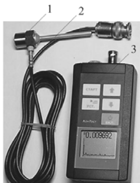
Figure. 2. Instrument for measuring oscillation parameters "Vibrometer 107B": 1 - accelerometer; 2 - probe; 3 - the vibrometer.

To determine the amplitudes of oscillations and displacements of the foundations of the molding machines, measurements were made with the help of a measuring device - the vibrometer 107B (Fig. 2).