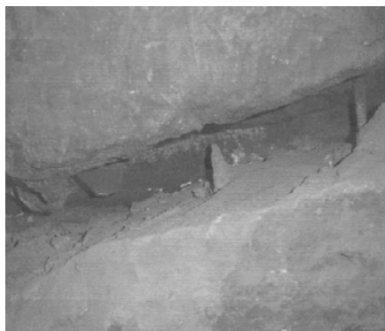
Figure 4. Horizontal reinforcement and corrosion of reinforcement in the wall of the base F-3

Reinforced concrete foundations for molding machines are made jointly with the floor. The condition of the foundation F-3 on the revealed defects indicates the impossibility of its safe operation, therefore, the study of the amplitude of the oscillations of the foundation, taking into account cracks and damage to the foundation during reconstruction. Structurally, the foundation is a massive base (bottom), on which the perimeter wall is installed along the perimeter and the base is connected in one. Cracks have been found in the area of connection of the foundation with the floor (Fig. 4).