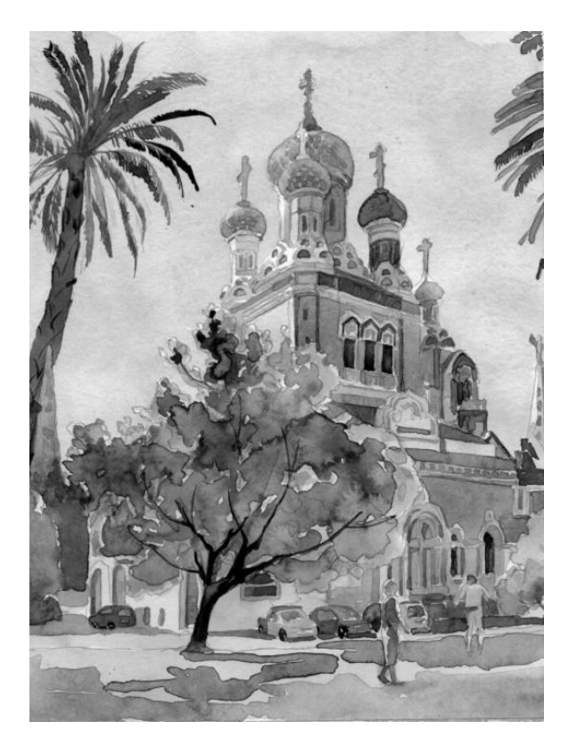
Fig. 3. St. Nicholas Cathedral in Nice. Watercolour by Chang Peng, 2019