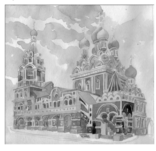
Fig. 4. St. Trinity Church in Nikitniki in Moscow. Watercolour by Chang Peng, 2019