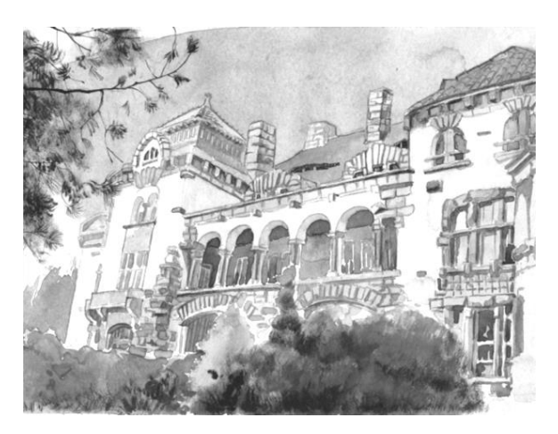
Fig. 2. The residence of the governor of Qingdao. Watercolour by Chang Peng, 2019

The unique character of the phenomenon of Northern National Romanticism in China lies in the fact that this movement originated and spread at a large distance from the northern countries, in completely various climatic and cultural conditions, which entailed the transformation of one of the most distinctive branches of Art Nouveau as it applies to the Chinese conditions. It is a unique fact that eclecticism is present to a much lesser extent in Northern National Romanticism of Qingdao than in the objects of other varieties of Art Nouveau in China. Were studied the historical reasons of appearance of the Art Nouveau objects at the European settlements territory in China and was observed the influence of the outside factors (the economical, political, religional and national) on the style's transformation and specific of Art Nouveau forming in Chinese architecture. Was analysed and argued the influence of the natural landscape to Art Nouveau transformation in China. Was argued the correlation of national and regional in the North National Romanticism in China.