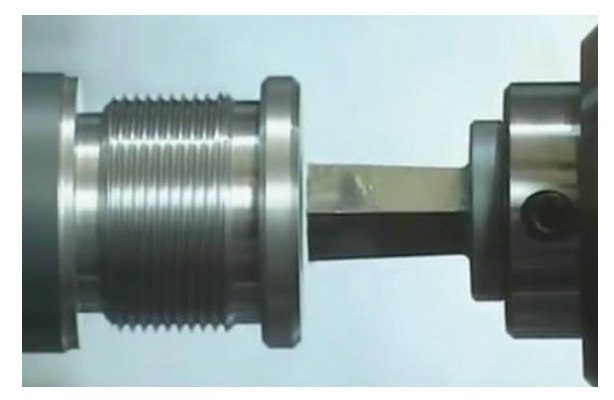
Fig. 1. Broaching of profile opening on the lathe

An improved variant to solve the problem on making profile openings is described in article [7]. It enables processing operations using the existing nomenclature of drill presses. This technical solution, according to authors of the given paper, makes it possible to apply a rotational head as a completing part of components for machines of the turning group, including CNC machine tools (Fig. 1).