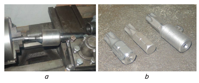
Fig. 4. Fabrication of profile openings with tool selfcentering: a – making profile openings; b – bit-centering technique

To simplify the design of rotational head is possible when tool self-centering is provided. Without changing the course of the rotational broaching process, we place the bit between a workpiece and the rotating center (Fig. 4).