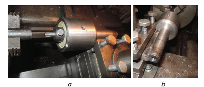
Fig. 3. Rotational head from rotating center: a - view of rotational head; b - method of fixing in the tool carrier

As a simplified variant of rotational head, it is possible to consider using the rear-rotating center, which has the following revisions (Fig. 3).