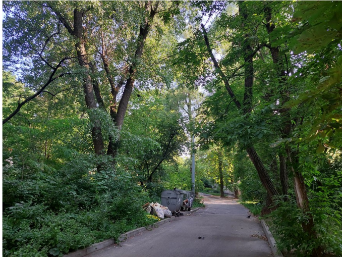
Fig. 1. The green area is a part of the Kadetskyi Hai historical eco-system

In the article, the main attention is paid to the territory of the so-called Pershotravnevyi residential area, which arose from the settlement of Pershotravneve. The settlement itself was formed in 1925 on part of the territory of the historical Kadetskyi Hai (Fig. 1).