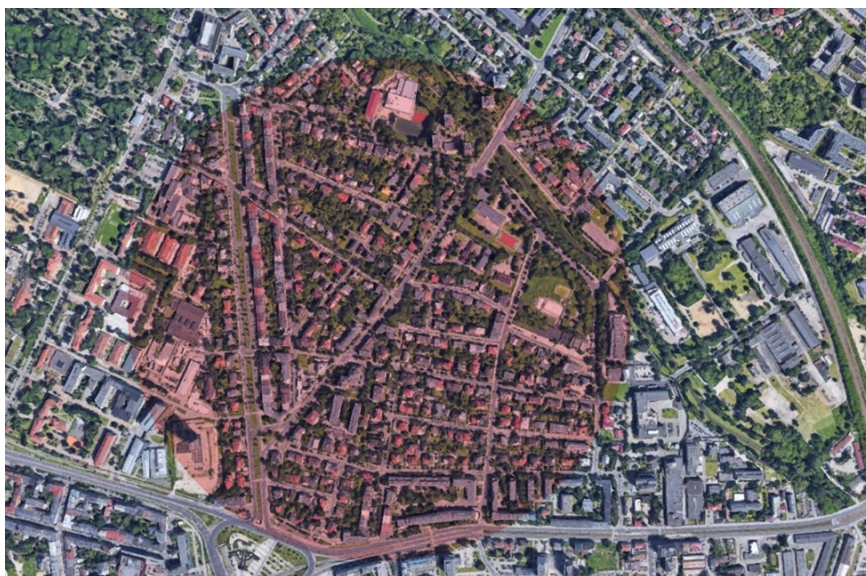
Fig. 8. The territory of Osiedle Oficerskie on the photo map of Cracow [24]. The territory of the residential complex is indicated in red

The development of estates has been transformed to some extent due to the increase in density, the introduction of multi-apartment development that took place in the 20th century, as well as numerous adaptations, reconstructions and extensions of existing buildings. However, it should be noted that the most valuable objects, as well as those created during the construction of the residential area, are under conservation protection, which guarantees the preservation of their original appearance.