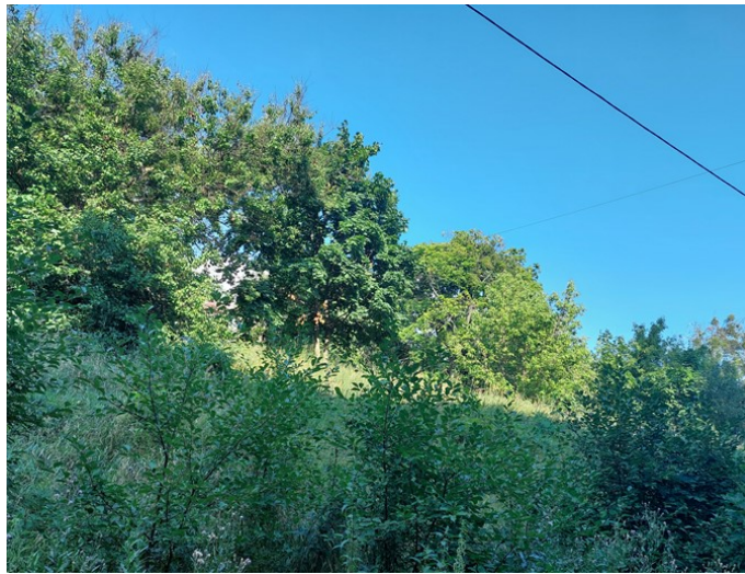
Fig. 4. A forest park in the midst of mass residential development is the remains of the historic Kadetskyi Hai

We conducted a comparative analysis of the very concept of Howard with the development system of the Pershotravnevyi residential area according to the main indicators: