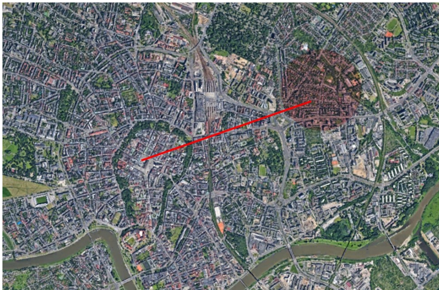
Fig. 5. Location of Osiedle Oficerskie on the map of Krakow relative to Market Square [22]

Osiedle Oficerskie is located in the northern part of Cracow, in the II Grzegórzki district (Fig. 5) The name comes from the village of Grzegórzki, included in the city limits in 1910.