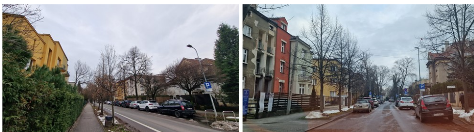
Fig. 9. The territory of Osiedle Oficerskie: Grochowska Street and respectively Kielecka Street

Osiedle Oficerskie is also well connected to other areas of Cracow. Public transport is provided by trams and city buses. Cracow’s main railway and bus stations are relatively close. This makes Osiedle Oficerskie, as it was 100 years ago, a desirable place to live in Cracow (Figs. 9-11).