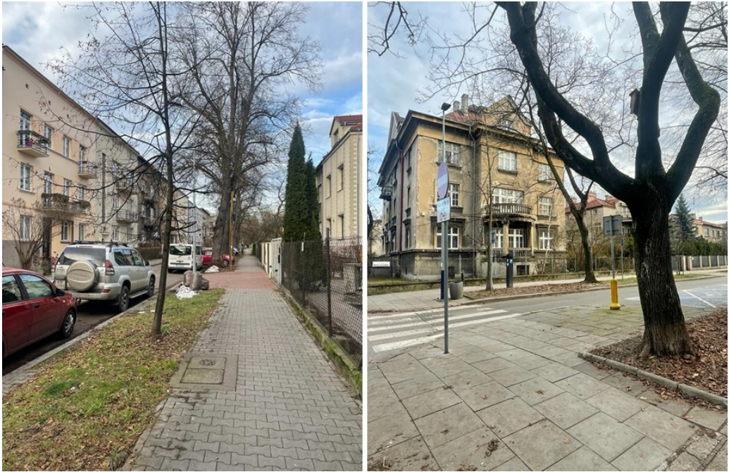
Fig. 10. The territory of Osiedle Oficerskie: Bandurskiego Street and Kielecka Street