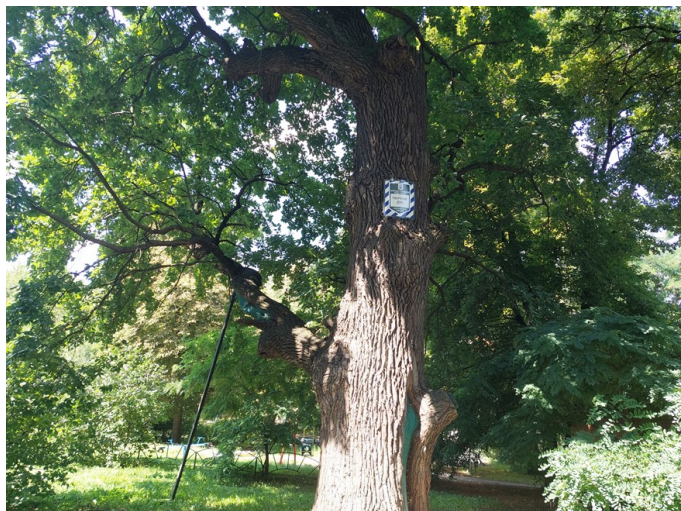
Fig. 2. Perun’s oak

monuments with the corresponding number are two oaks – the so-called Perun’s oak on the Hennadiia Vorobyova Street, 3–5 (Fig. 2) and the so-called Frolkin’s oak on Aviakonstruktora Antonova Street, 2/32. Thus, we have a unique example of the fragmentary preservation of the historical forest eco-system with the river Vershynka within the limits of a modern residential area.