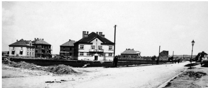
Fig. 7. View of Osiedle Oficerskie during its construction.

The construction of Osiedle Oficerskie lasted quite a long time. The first projects of houses appeared in the 1920s, but their construction continued until the Second World War.