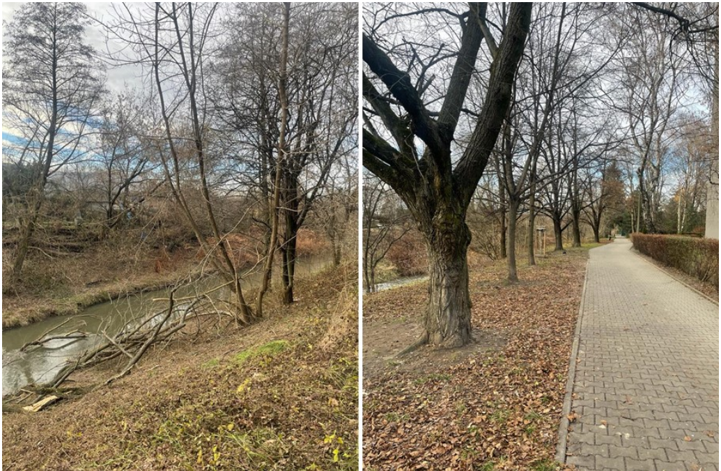
Fig. 11. The territory of Osiedle Oficerskie: green areas