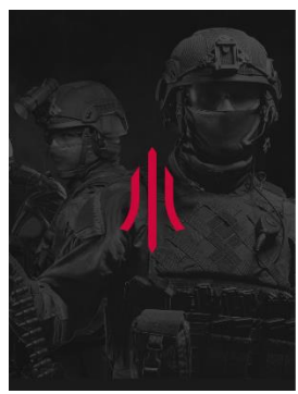
Figure 2: Website "Mini-Library of the Ukrainian Military" (https://tmg-training.org.ua/)

A new e-library created by The Mozart Group is rather unusual. In the summer of 2022, they launched a platform called "Mini-Library of the Ukrainian Military" (https://tmg-training.org.ua/) for defenders of Ukraine (Fig. 2).